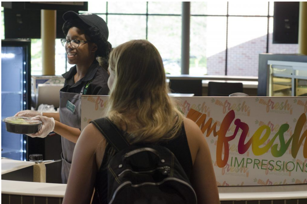
Our first time at Fresh Impressions! I thought that this was just a juice/smoothie station but they actually offer zoodle (zucchini noodles) bowls!