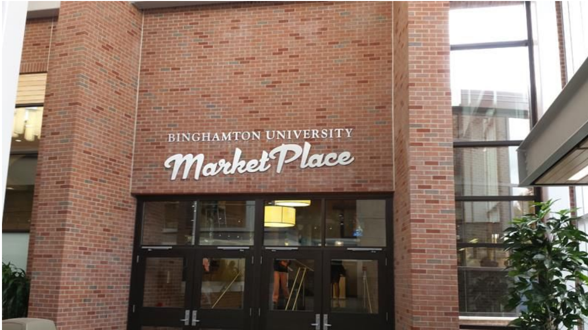
Entering the Marketplace! Contrary to the name, this is no supermarket, but a food court containing a wide variety of options, ranging from salads to fried chicken to Asian cuisine!